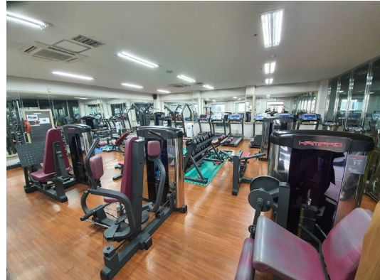
<Laundry Room and Gym>